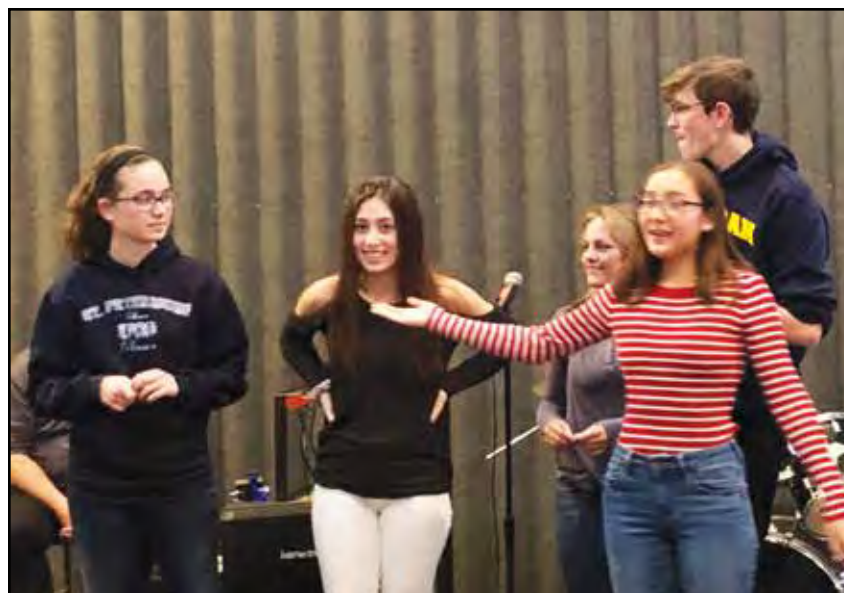
PHS performing artists shared their talents, time, and passion.