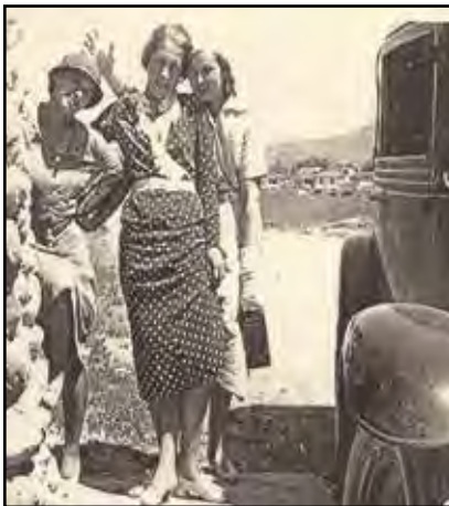
Read about the harrowing road trip that beat all road trips on page 14.