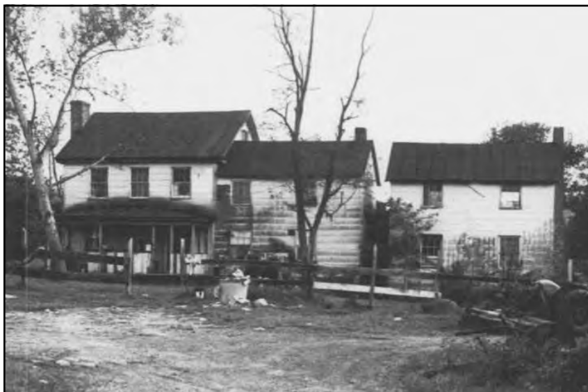
The Thomas White Farmhouse during the 1970s.

A few weeks ago, a friend who lives in the vicinity of Edwards Ferry provided me with a letter he had received from the county's historic preservation commission. The letter served notice to residents in the area of the commission's recommendation to the county planning board to remove the historic Thomas White Farmhouse, located on Club Hollow Road, from the county's list of historic sites. The significance being that if the planning board agrees with the recommendation—which is highly likely—the restrictions on home demolition will be lifted.