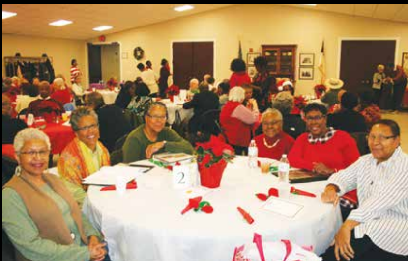
The choir from Western Methodist Church entertained at the annual seniors luncheon.