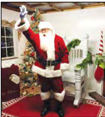
The annual Holiday Lighting Festival was a ho-ho-ho on the community spirit scale. See more pictures on page 17.