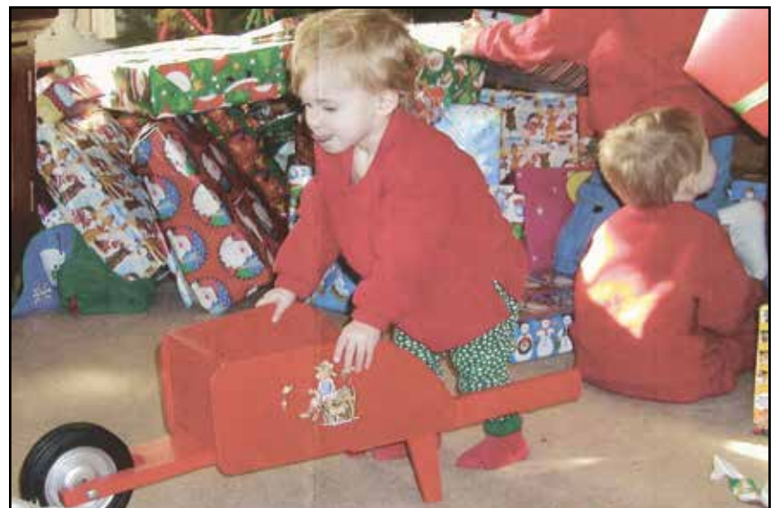
This red wagon was one of the favorite toys made by Santa while he lived in Poolesville.