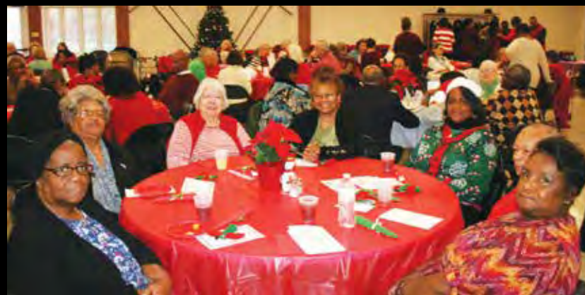
The holiday spirit was in abundance with these women as they attended the Odd Fellow Annual Holiday Luncheon.