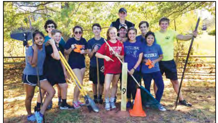
Volunteers of StoryWalk.