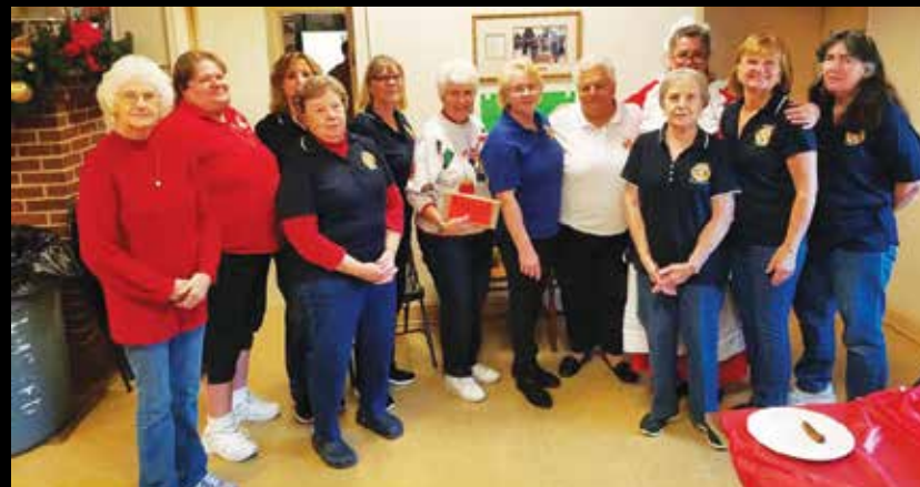
The members of UMCVFD's ladies' auxiliary made the annual Santa Breakfast possible.