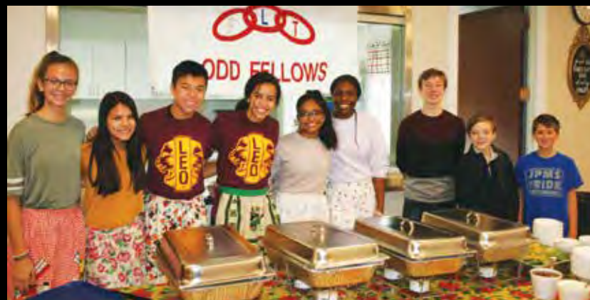
The local Leos Club members (the youth arm of the Monocacy Lions Clubs) were dedicated volunteers serving the attendees of the Odd Fellows' annual Holiday luncheon for widows, widowers, and senior citizens.