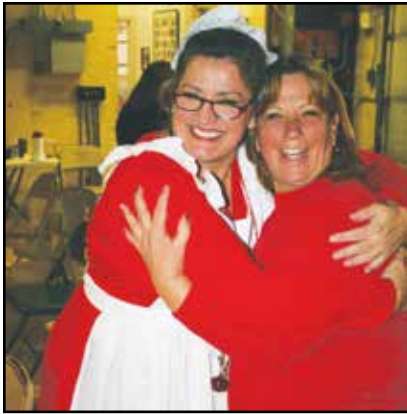
The holiday spirit shone with these two ladies at the Santa Breakfast. See more pictures in Family Album on page 2.

December 13, 2019 • Volume XV, Number 18