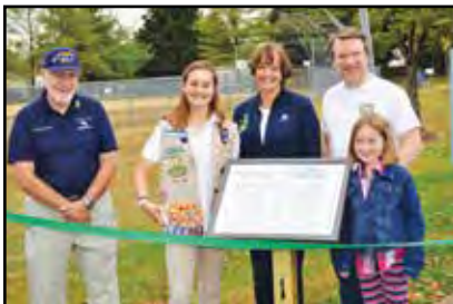
New pathway in Poolesville result of Gold Star project. More on page 4.