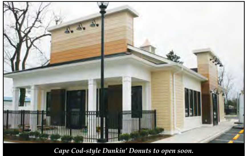
Cape Cod-style Dunkin' Donuts to open soon.