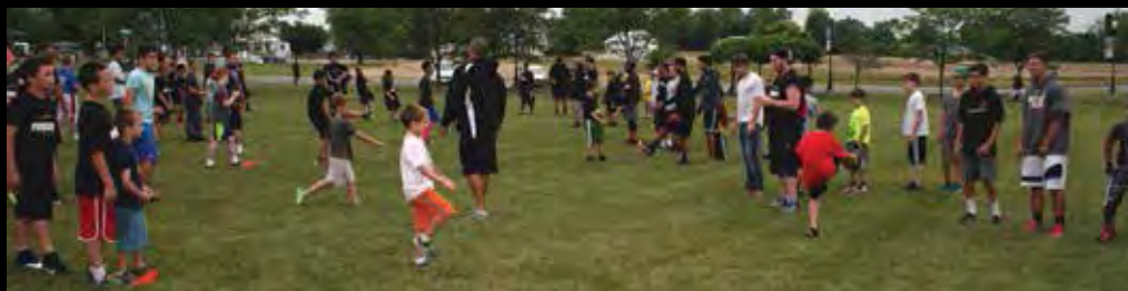
Introduction to PAA's youth football camp was held at Whalen Commons.