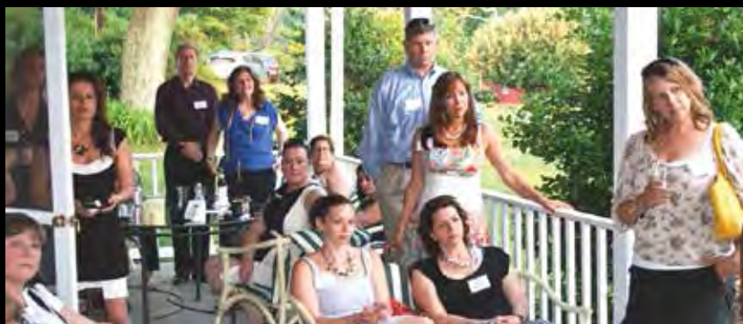
Members of the Poolesville Area Chamber of Commerce were hosted by the Madison House Autism Foundation at Madison Field Farm in Dickerson.