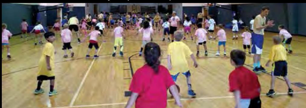
PBA's summer camp wrapped up at Poolesville Baptist Church.