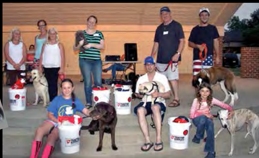
The winning dogs at the Bark in the Park Event.