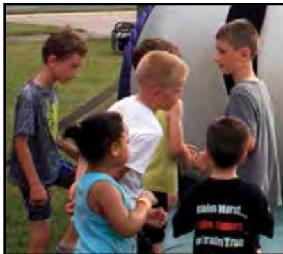
Family fun, food, inflatables, and music at the PES annual carnival. More pictures are on page 15.