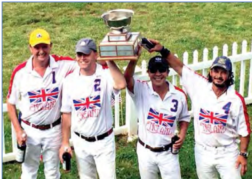
England won its challenge over the USA at Capitol Polo Club's recent tournament.