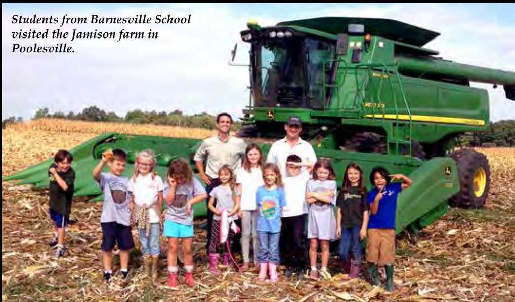
Students from Barnesville School visited the Jamison farm in Poolesville.