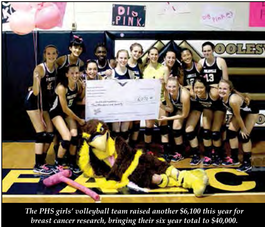
The PHS girls' volleyball team raised another $6,100 this year for breast cancer research, bringing their six year total to $40,000.