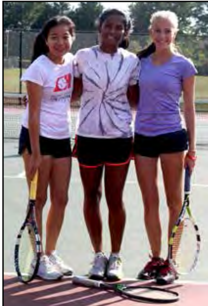
The PHS varsity girls' tennis team captains lead the 2014 Falcons. See Youth Sports on page 14.