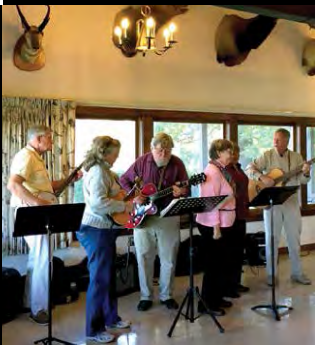
Local musicians, Not the Choir, perform at the recent Royce Hanson Award ceremony.