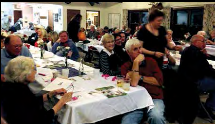
The Rural Women's Republican Club held its annual Saturday Night in the Country fundraiser at the B-CC Izaak Walton League.