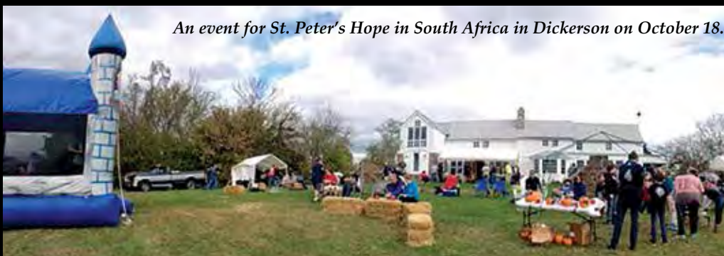
An event for St. Peter's Hope in South Africa in Dickerson on October 18.