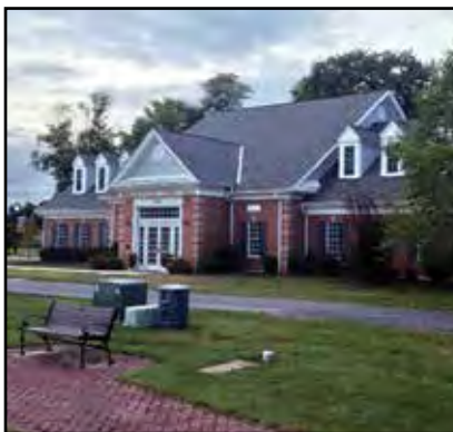
There's something odd about Beall Street. Is it the Poolesville Town Hall? The answer is in Mystery History on page 10.