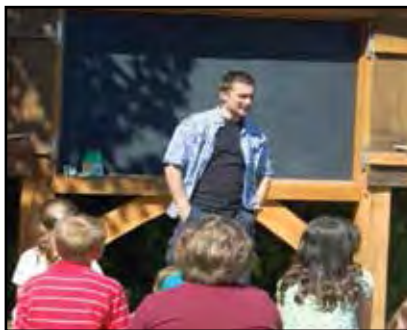
An outdoor classroom for JPMS. Read more in Town of Poolesville on page 3.