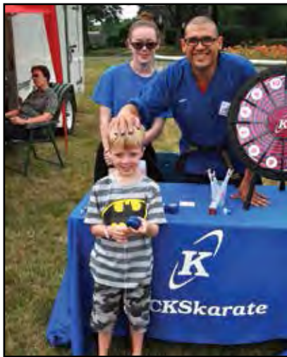
The PES PTA Carnival was a fun fair for all. See more pictures in Family Album on page 2.