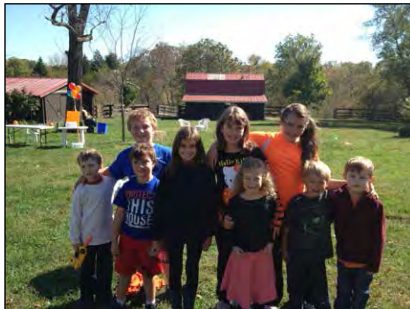
Monocacy Elementary students joined together to help a good cause.

There was a bottle labeled as "One Minute Cough Cure" and another gave an indecipherable percentage of chloroform.