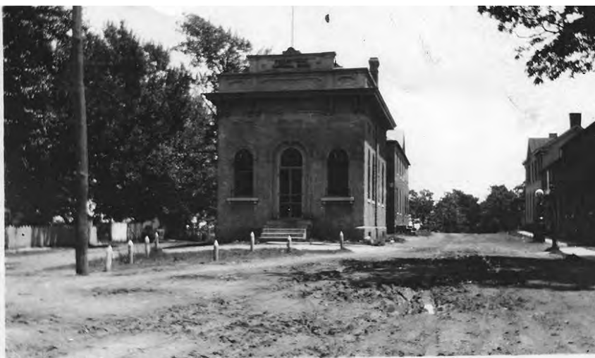
The Poolesville National Bank in 1912 shortly after the new town sidewalks (right) replaced wooden ones.