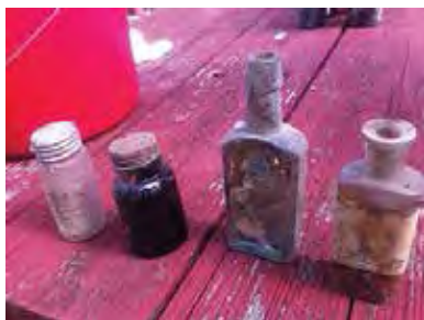
This bottle was found in an unexpected place. Read about it in Tidbits on page 11.