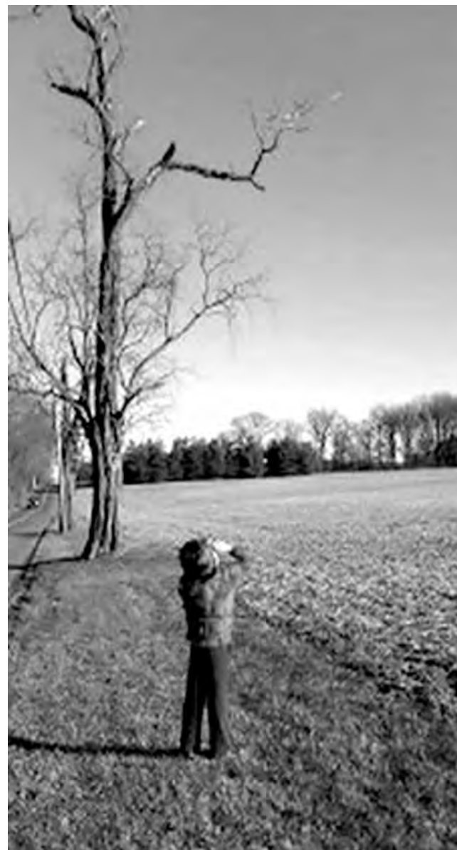
Amazed by a daytime moon. Life is not always wasted on the young.

I figured I'm safe with that promise. Getting this motley crew out all at the same time is a difficult as me walking away