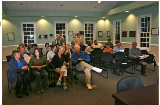
The public hearing on zoning changes in Poolesville drew more attendees than normal.

The report submitted on the ordinance used the recently-revised Master Plan as its guidepost. Both the new ordinances and Master Plan seek to control, through a deliberative process, the overall expansion in town population from its current five thousand to the targeted sixty-five hundred specified in the Master Plan. This is a reduction from the seventy-five hundred cap on population from previous plans.