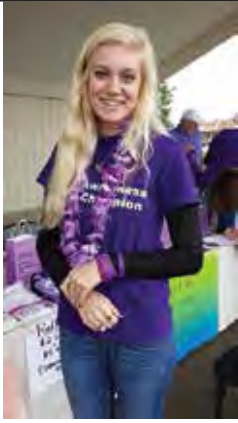
These people walked for a good cause. More pictures are in the Family Album on page 2.