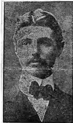
He has a road named after him. Read more in Mystery History on page 20.