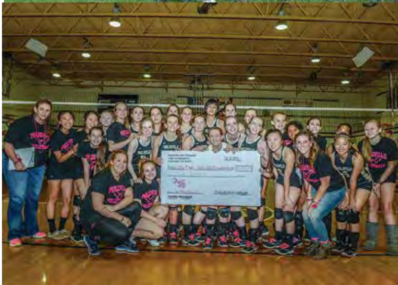
The PHS volleyball teams raised $5,000 to benefit cancer research.