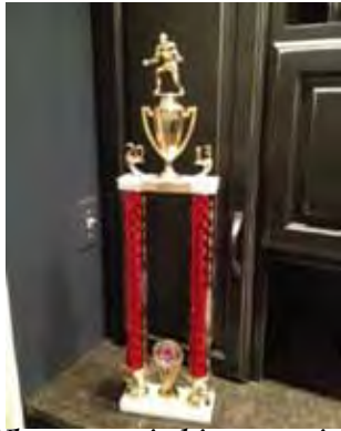
When you win big, you win a big trophy. See who won this in Tidbits page 8.