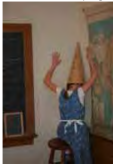
If you are bad, sometimes you get time out in the corner. Don't know where to buy the hat, though. See more in Family Album page 2.