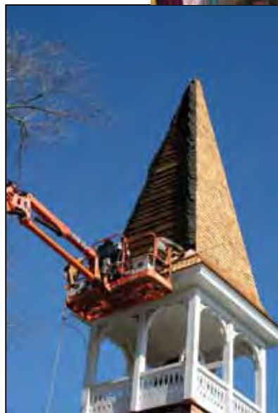
The renovation of the historic St. Peter's steeple is nearly complete and awaits the placement of the cross.