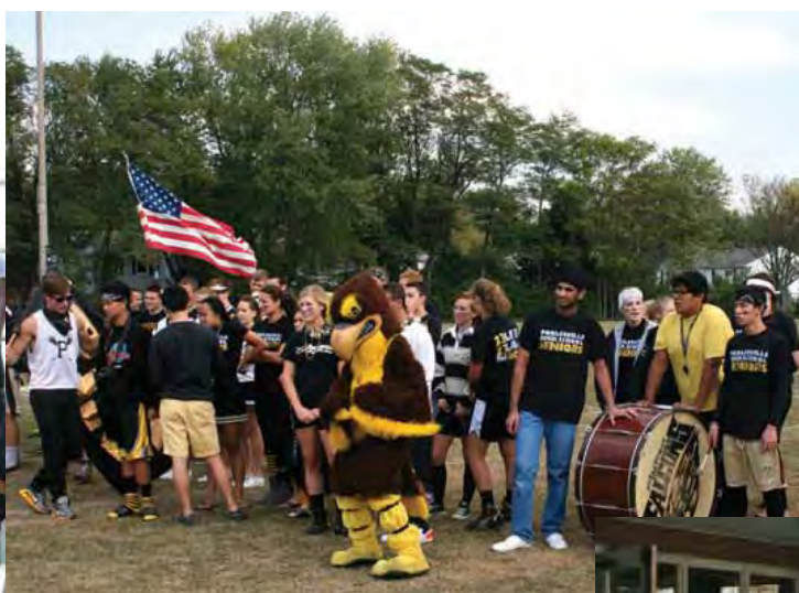
PHS 2012 Homecoming Pep Rally

A mystery fan at the 2012 PHS Homecoming Pep Rally.