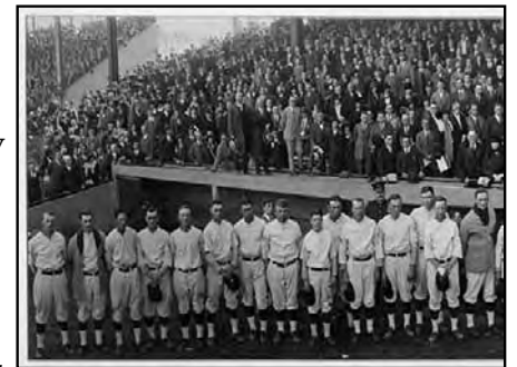
The 1924 World Champion Washington Nationals