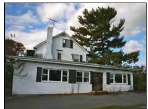
At the old Potomac Golf Course, now Poolesville Golf Course, a ghost has been seen in the upper window.

Annington Estate – White's Ferry Road Our first ghost story is