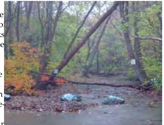
Ten Mile Creek

The current Clarksburg Master Plan, approved in 1994, lays out a four-stage development process requiring specific criteria be met at each stage. Triggers allowing development to advance to Stage 4 were met