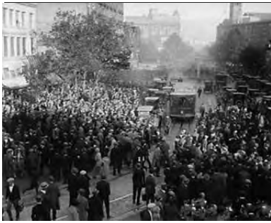
The Nationals win the World Series! This scene somehow kept three local lads out of jail. See Local History on page 15.