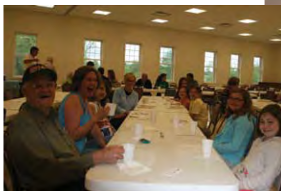
Throngs of pancake and sausage fans celebrated The Day Before Mother's Day at the Monocacy Lions Pancake and Sausage Breakfast at St. Peter's Episcopal Church.