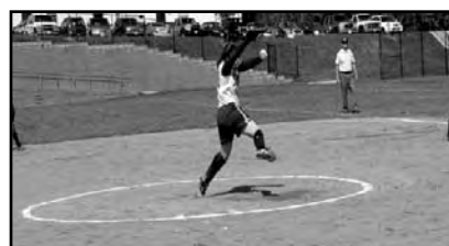
The CHS Cougars in action.