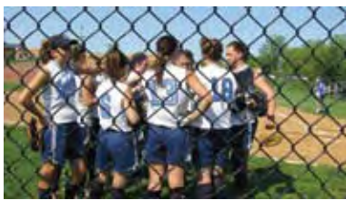
The CHS Cougars are on the ball this spring. See Youth Sports on Page 14.