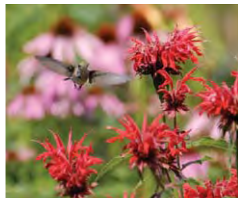
A hummingbird enjoys some nectar from one of his favorite flowers, the monarda.

Your garden can provide a refuge for a wide range of fungi, plants, and animals by adding wildlife super plants to existing or new borders, ponds, and containers. Choose multi-purpose plants with nectar, pollen, seeds, or berries. You can