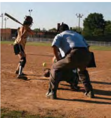
A Poolesville Falcon refuses to offer on a pitch low and inside. Read about the team in Youth Sports on Page 10.