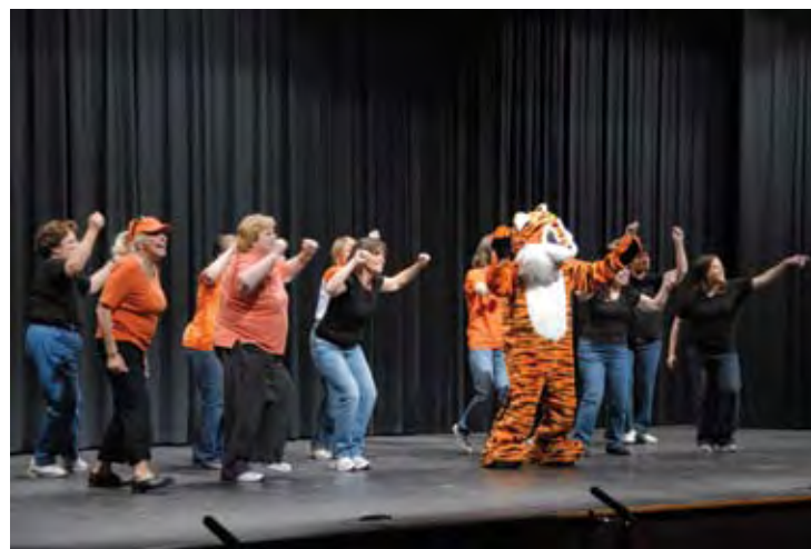
Tigers one and all at the Poolesville Elementary School Talent Show.