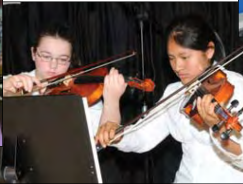
JPMS Symphony Youth Orchestra performers brought their talents to the event.