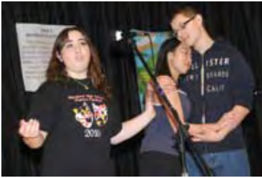
Cast members of the Pooleville High School Midnight Players entertained the crowd at the Pooleville Business Fair. Check out the pictures on Pages 12 and 13.