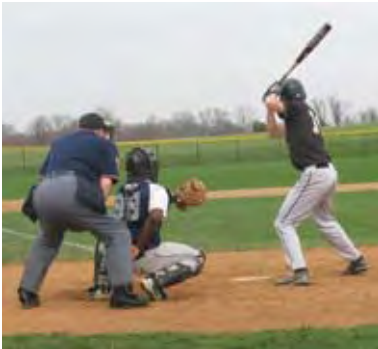
Once the snow melted it was just a matter of time. Read about Pooleville baseball in Youth Sports on Page 18.