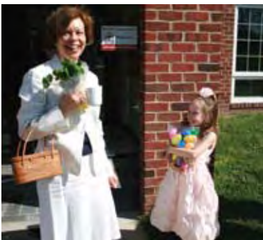
Happiness is finding a bunch of Easter eggs. More pictures of other events are in the Family Album on Page 2.