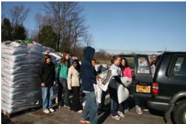
The Poolesville High School Boosters and student athletes loaded up mulch in an annual rite of spring.