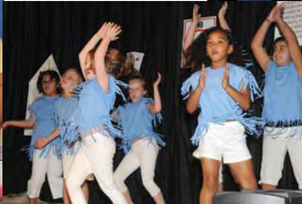
The Junior Jazzercisers did a workout to work up the crowd.