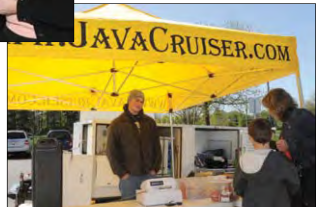
Java Cruiser supplied fresh coffee and other drinks.