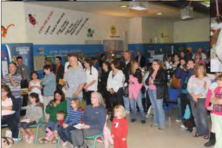
An estimated 300 to 350 people visited the twenty-nine vendor booths at the Poolesville Spring Business Fair.