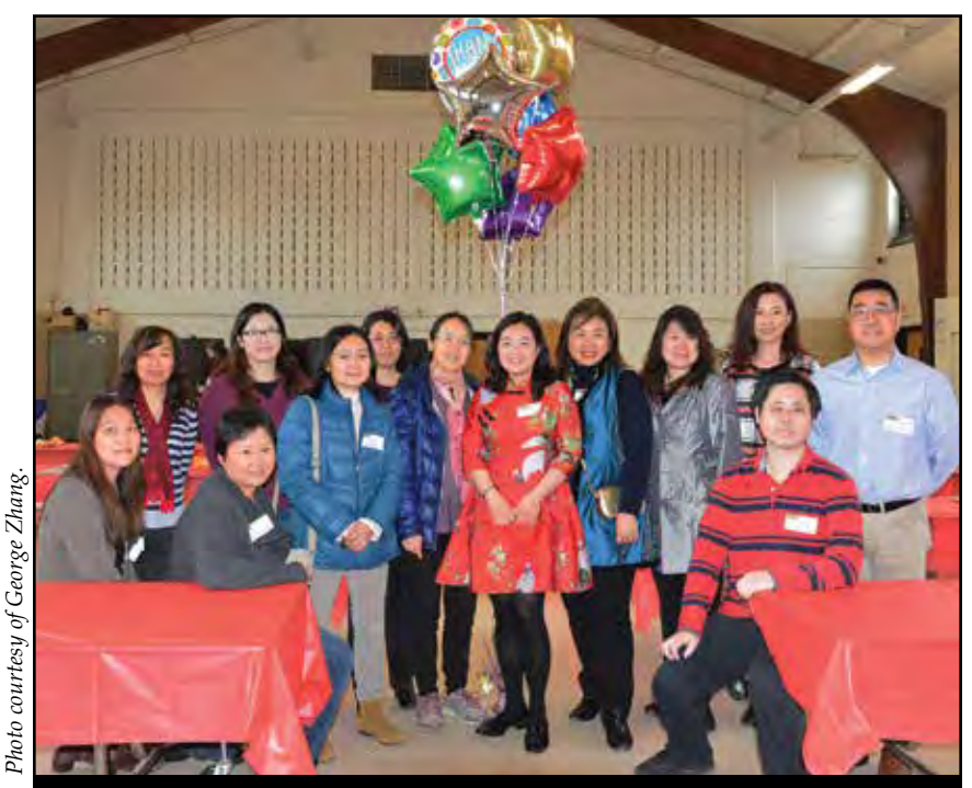
Parent organizers of the PTSA appreciation luncheon posed for a group photo.

Staff Appreciation Luncheon Held to Celebrate a Late Chinese New Year