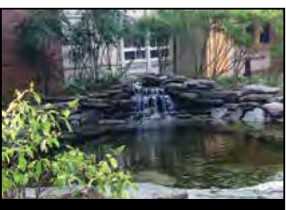
A section of the twenty-year-old outdoor classroom at Poolesville Elementary School.

It's hard to imagine, but it has been twenty years since Poolesville Elementary School was gifted an outdoor classroom. Through the hard work of parent volunteers, teachers, Fine Earth Landscape, and Capital Fence, a beautiful waterfall was created with plantings and wooden benches.