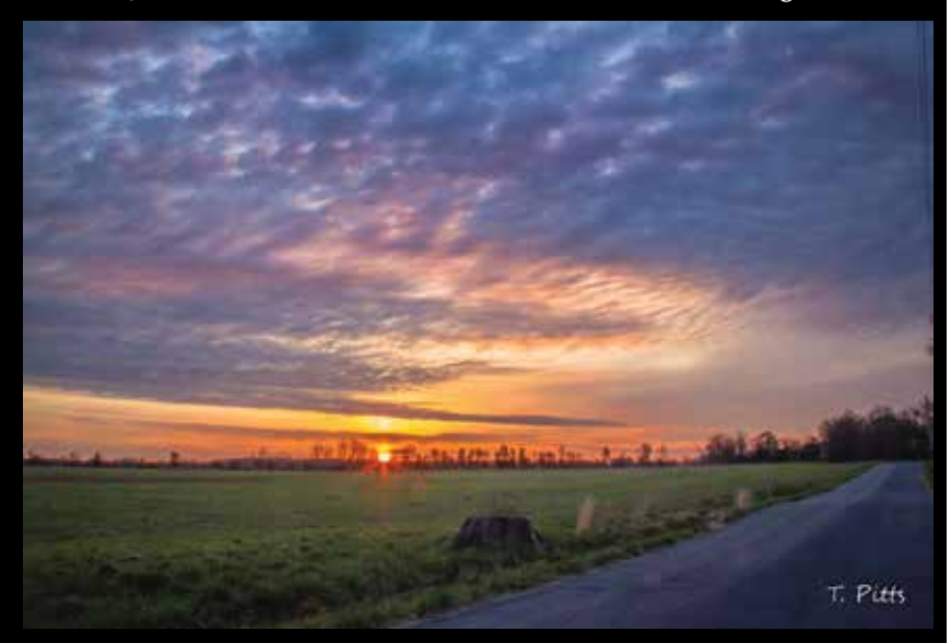
Terri Pitts caught this beautiful sunset at Willis Road off of Hughes Road.