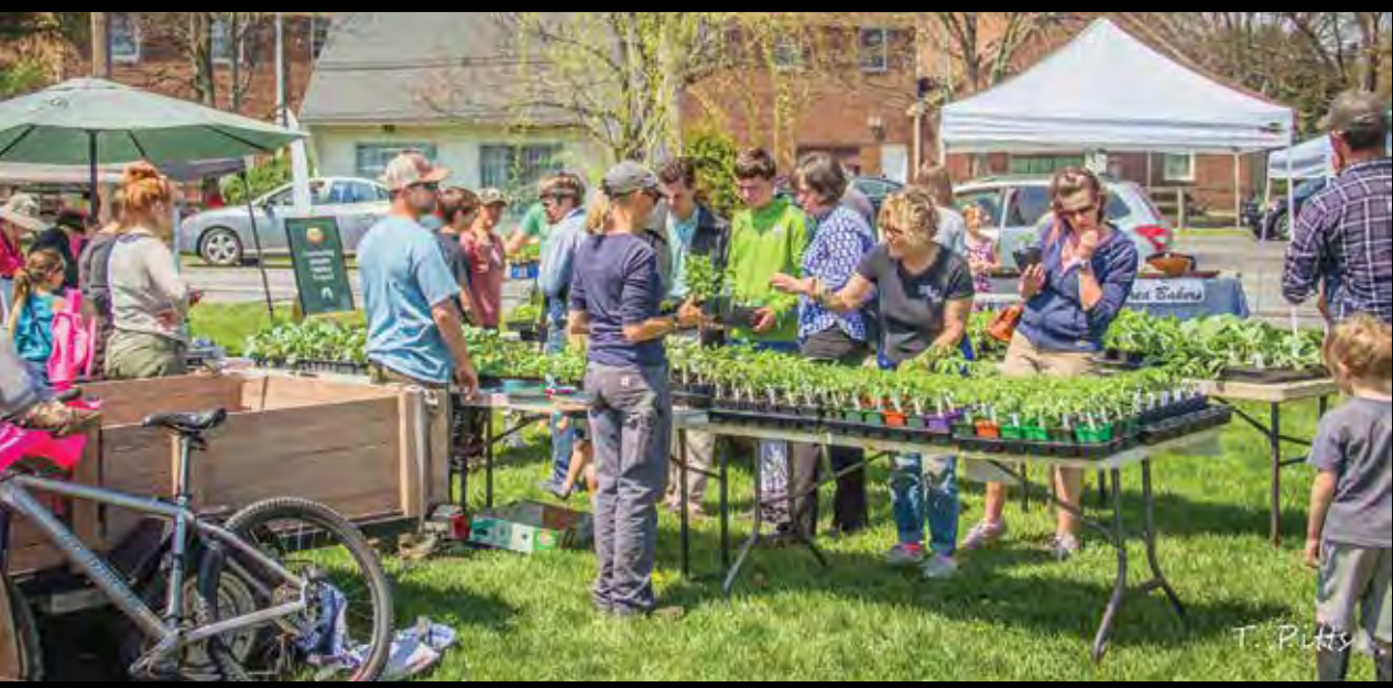
The Blue Hearth Market Weekend featured spring plants from Common Ground, music, and fun children's activities.