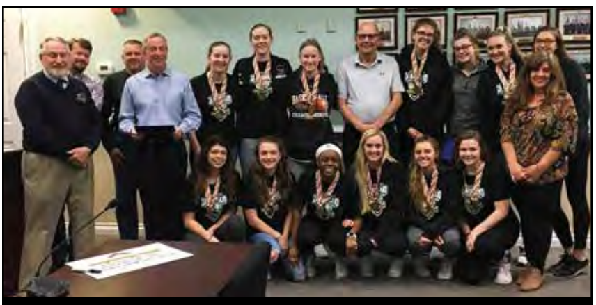
Town commissioners capped the PHS girls' basketball state championship season with one last heartfelt proclamation.

At their April 16 meeting, Poolesville's commissioners gave final approval to a longstanding proposal to take over the ownership and maintenance of the town's main thoroughfare, Fisher Avenue. Currently, Fisher Avenue is under the control of the county, and negotiations have been underway for many months to give the town ownership of the road.