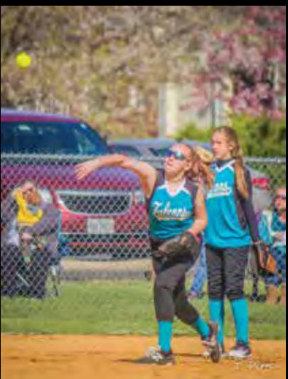
PAA's U-13 girls' softball league, the feeder league for future varsity stars, gets the spring season going.