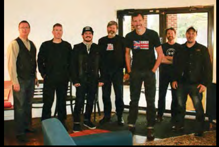
These motorcycle enthusiasts lined up at Watershed Café for the first-ever Poolesville Breakfast and Bikes.