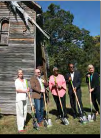
State and local officials joined in the ceremony to begin the restoration of Loving Charity Lodge.

The Warren Historic Site, located at the corner of White's Ferry and Martinsburg Roads, was the venue for the celebration of the African American community that originated after the Civil War. A thriving and dynamic community, consisting of previouslyfreed residents and former slaves, included up to thirty or forty homes with the nucleus of the hamlet being its church, the Warren Methodist Episcopal Church. The nineteenthcentury village had its own post office, store, and blacksmith shop, as well as the Martinsburg Negro School, a single-room schoolhouse for grades