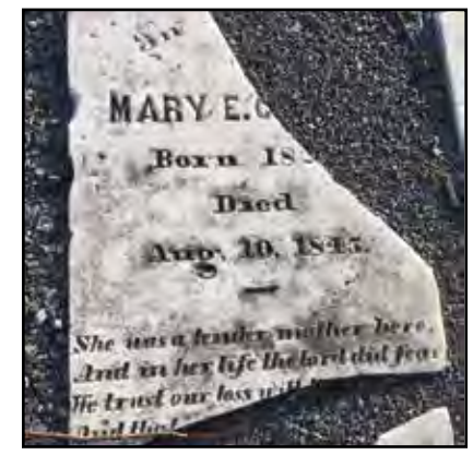
These are just a few pieces of the puzzle. A sharp eye solved the riddle. Find out more in Tidbits on page 6.