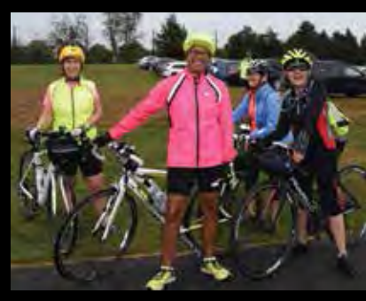
A little rain didn't dampen the spirits of these energetic women, riding to help the good cause of the Agricultural Reserve.