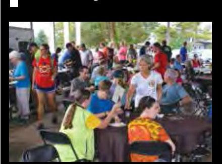
Break time during Ride for the Reserve fundraiser.