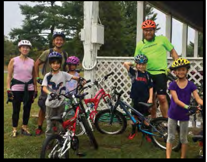
Families enjoyed the fresh air, the good cause, and the pure fun of the Ride for the Reserve Fall Farm Bike Tour to benefit Montgomery Countryside Alliance.