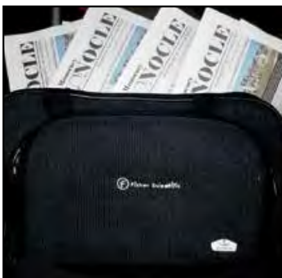
You will want to pack a Monocle or two on your summer travels. Find out why on page 8.