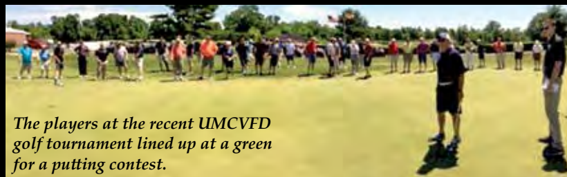
The players at the recent UMCVFD golf tournament lined up at a green for a putting contest.