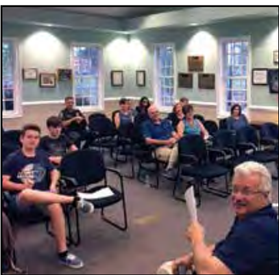
These people are working on a very important committee. See what they are up to on page 8.