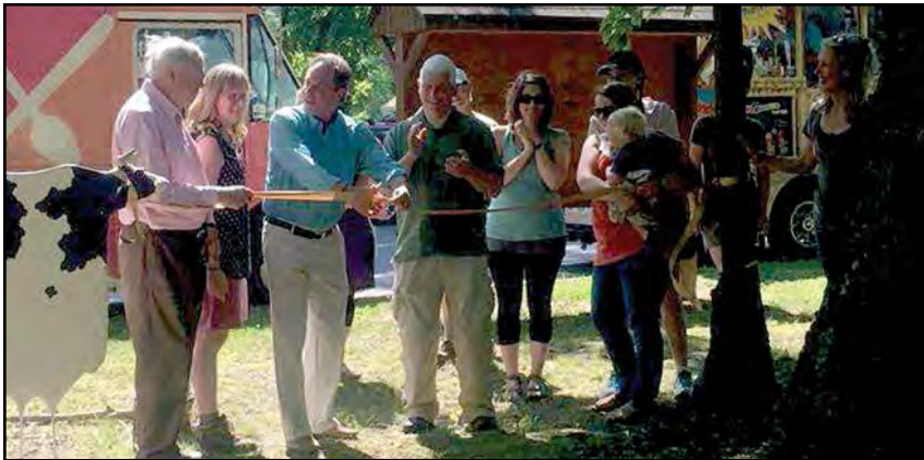
The Common Ground Market at Owens Park in Beallsville will be open on the second Sunday of the month through October from 10:00 a.m. to 2:00 p.m.

A ribbon-cutting ceremony was held on June 12 for the opening of Common Ground Market at Owens Park in Beallsville.