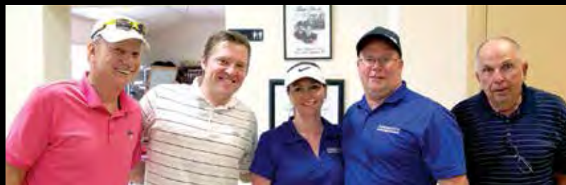
The Rosenbloom & Butler CPA team took second place at the recent UMCVFD golf tournament.

NOW OFFERING A REDUCED-SIZE ROLLOFF FOR MANURE REMOVAL TO ACCOMMODATE THE ONE OR TWO HORSE FARM AT AFFORDABLE AN PRICE.