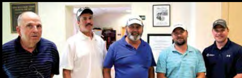
The winning team at the UMCVFD golf tournament. Wish we could tell you the team name. They departed before we could get it. Perhaps a reader can fill us in, so we can tell you in Tidbits in a future issue!