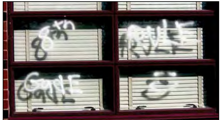
Part of the graffiti vandalism at John Poole Middle School.

Detectives from the 1st District Station are investigating the crime and released the surveillance photos to the media. They are asking the public's help in identifying the culprits.