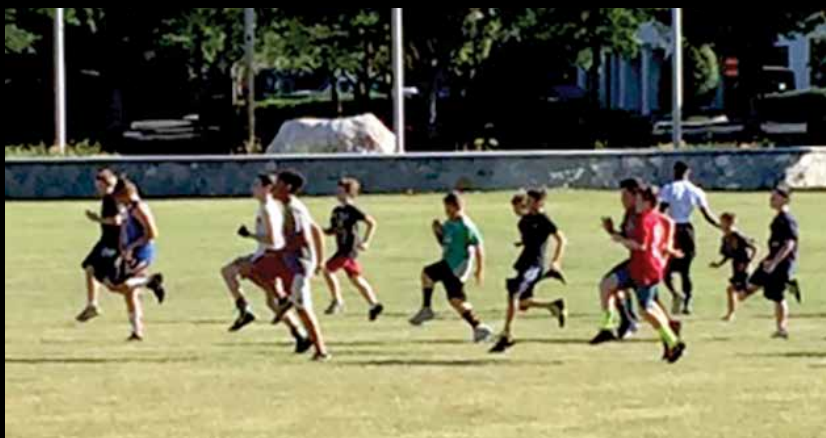
For these future PHS football stars, summer PAA football camp started on a sweltering evening.