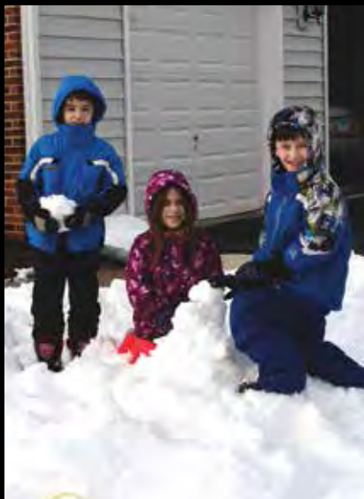
The Wallingford triplets of Stoney Springs worked together to build their snowman.