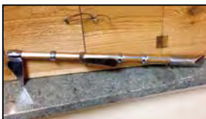
Some lucky bidder left the Monocacy Lions auction with this, but no one knew what it was. If you do, please let us know at editor@monocacymonocle.com.