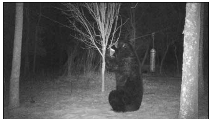
Poolesville's bear may be smarter than the average bear.

As word got out that a bear was helping himself to local feeders, some neighbors worried that its presence