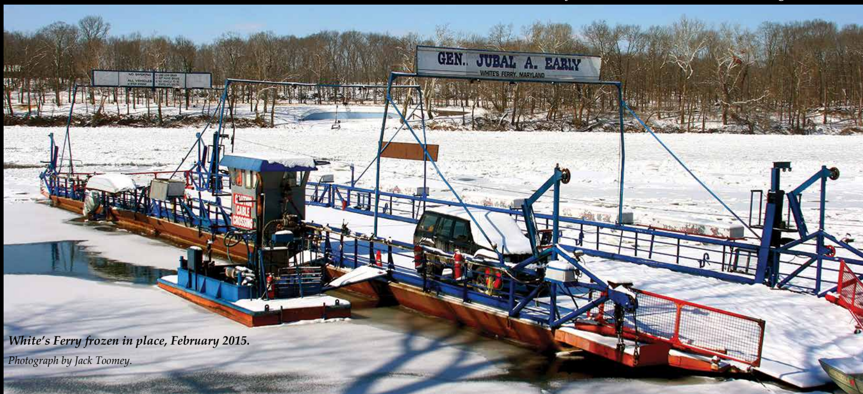
White's Ferry frozen in place, February 2015.