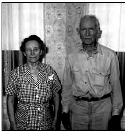
This couple has a street named for them. See Mystery History: Streetwise on page 11.