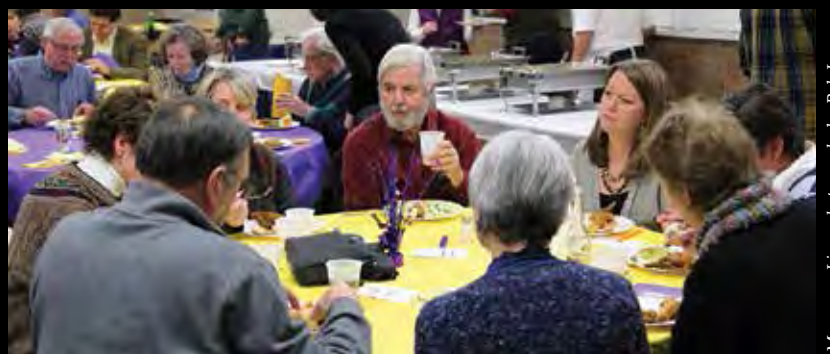
The Monocacy Lions Annual dinner auction was a big hit.