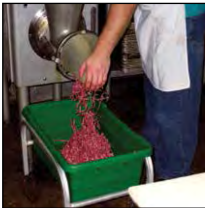
Ground venison for the hungry. See Pulse on page 13.