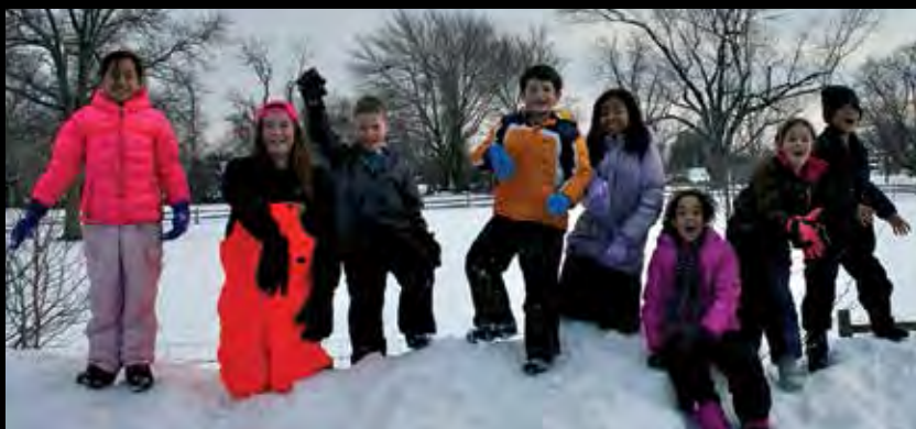
These Brightwell Crossing snow-fort warriors delight that their snowballs hit the target.