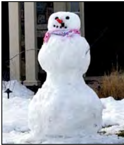
See more fun in the snow in Family Album on page 2.

February 27, 2015 • Volume XI, Number 23