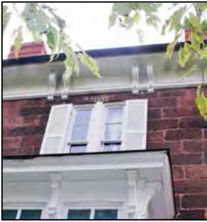
The Rocklands Farmhouse originated as the Allnutts' farm in 1870. Read all about it on page 10.