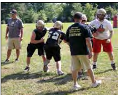
A very successful 2013 leads to a bolstered football program for 2014. See Youth Sports on page 12.