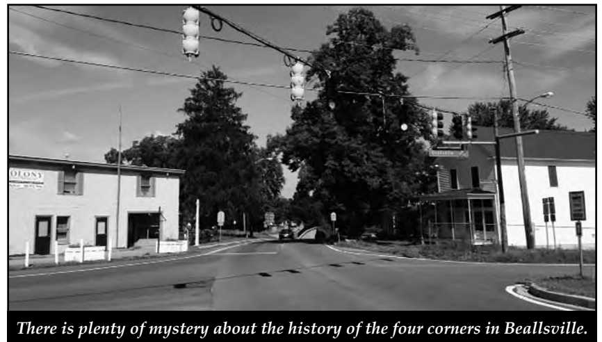
There is plenty of mystery about the history of the four corners in Beallsville.