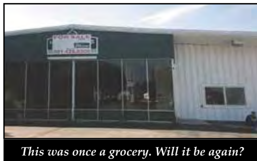
This was once a grocery. Will it be again?