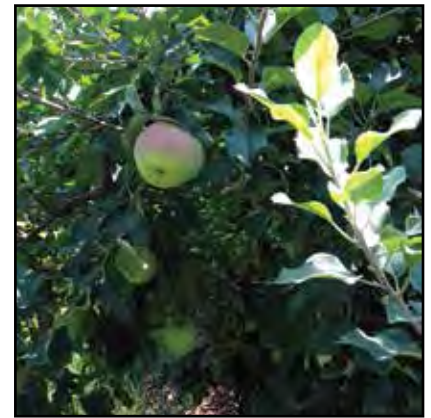
Making it as a farmer takes more than counting on Johnny Appleseed.