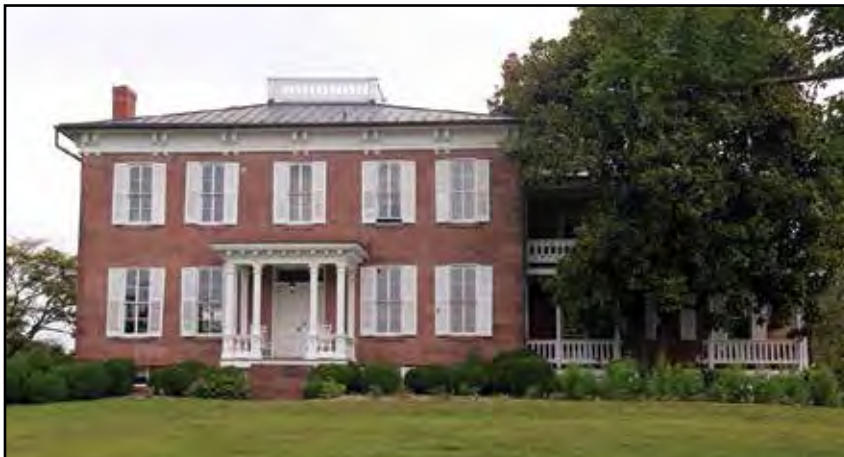
Rocklands Farm: A proud past meets a promising future.

The property was once part of a large tract of land known as