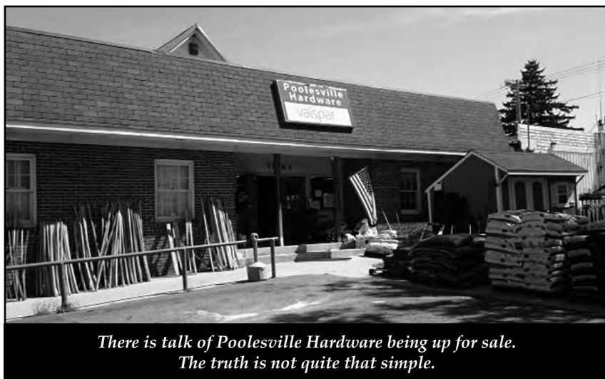
There is talk of Poolesville Hardware being up for sale. The truth is not quite that simple.