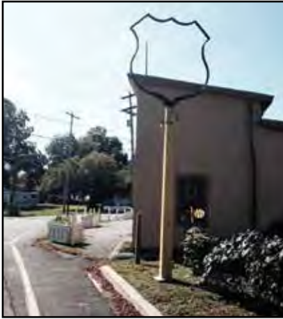
This sign of the times tells the story of old times in Beallsville. Read more in Mystery History on page 16.