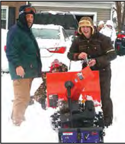
Oh, the fun we had and the stories we'll tell. Live through the Winter of 2014 one more time in our Photo Collage on page 13.