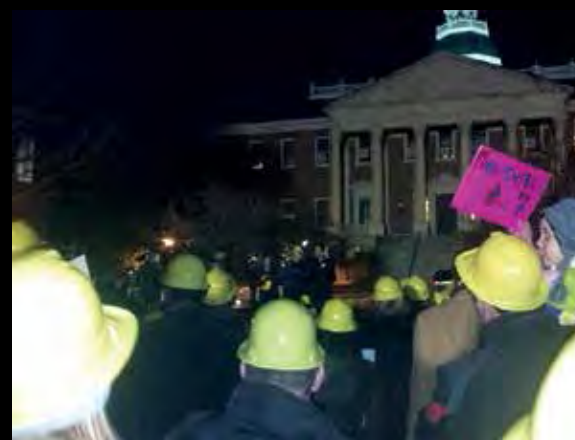
Local residents, who traveled to Annapolis to join supporters from all over Maryland demanding more state funds for school construction, were surrounded by a group symbolically wearing hard hats.