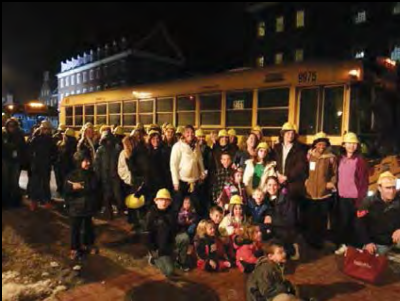
Over fifty citizens packed a bus to Annapolis on March 6 to demand more state funds for school construction.