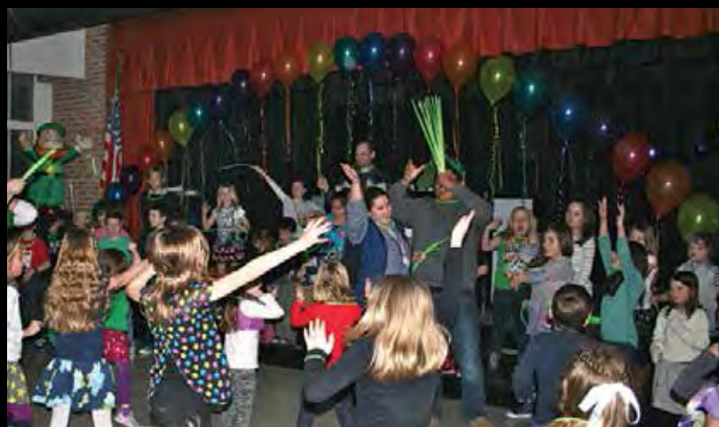
The kids of Poolesville Elementary School had a great time at their early St. Patrick's Day dance.