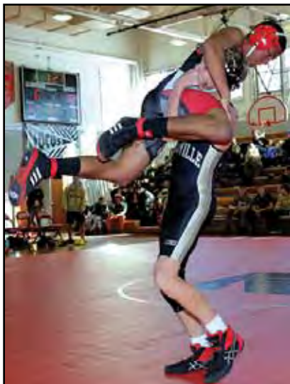
What goes up must come down. Read more about the PHS Wrestling Team in Youth Sports on page 12.