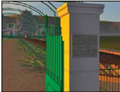
The virtual gardens of Monet? Maththerapy? A man who lives in Poolesville? It all comes together in Focus on Business on page 11.