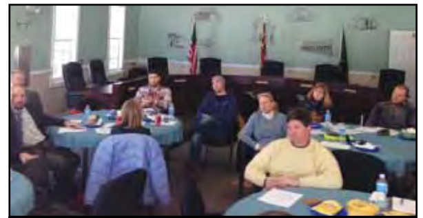
Large and small farmers, county and town government officials, a produce retailer, and others came together to discuss the merits of a food hub for Poolesville.