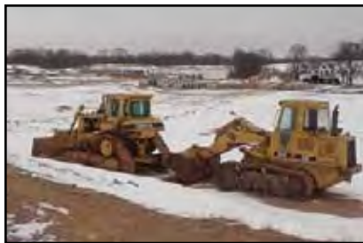
The battle between Ten Mile Creek and more Clarksburg development continues in Local News, on page 7.