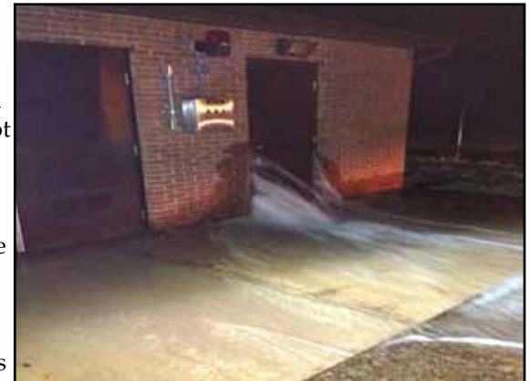
A broken coupling flooded well house in Poolesville.