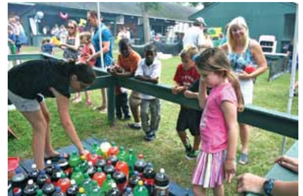
Kids love the ring toss game at St. Mary's annual festival.