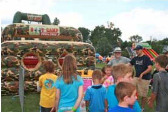
The Boot Camp inflatable challenge proved to be the most popular new attraction at the PES Annual Carnival.