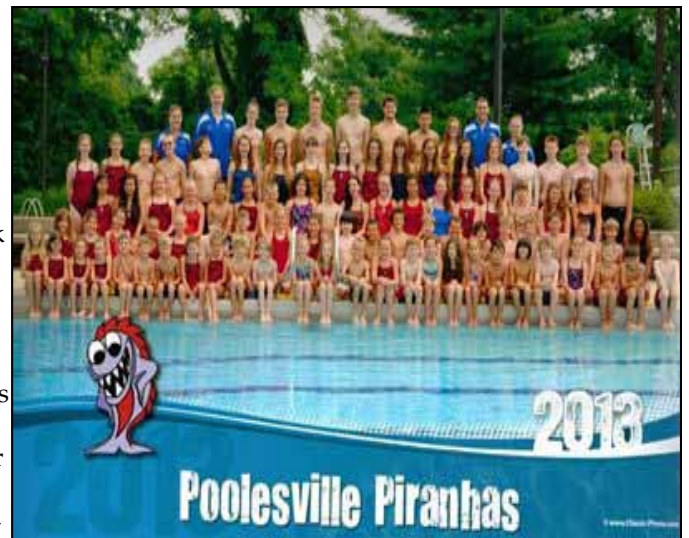
2013 Poolesville Piranhas Swim Club