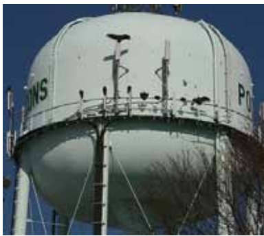
Study finds cell phones on water towers safe for man and vultures. See more on page 18.