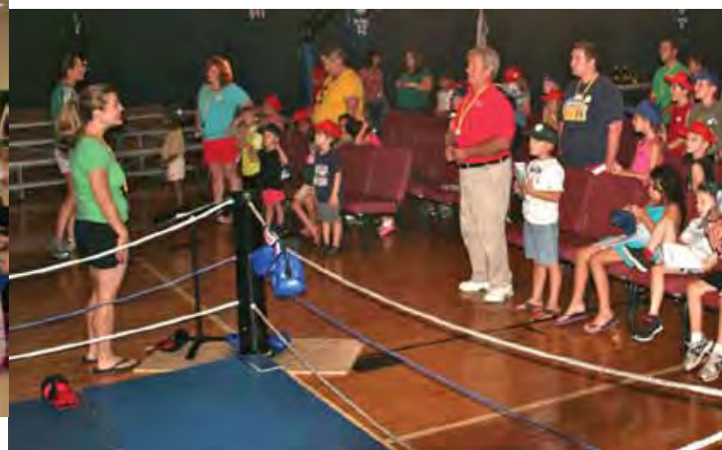
The Poolesville Baptist Church had an Olympics theme to carry its message Vacation Bible School message this year.