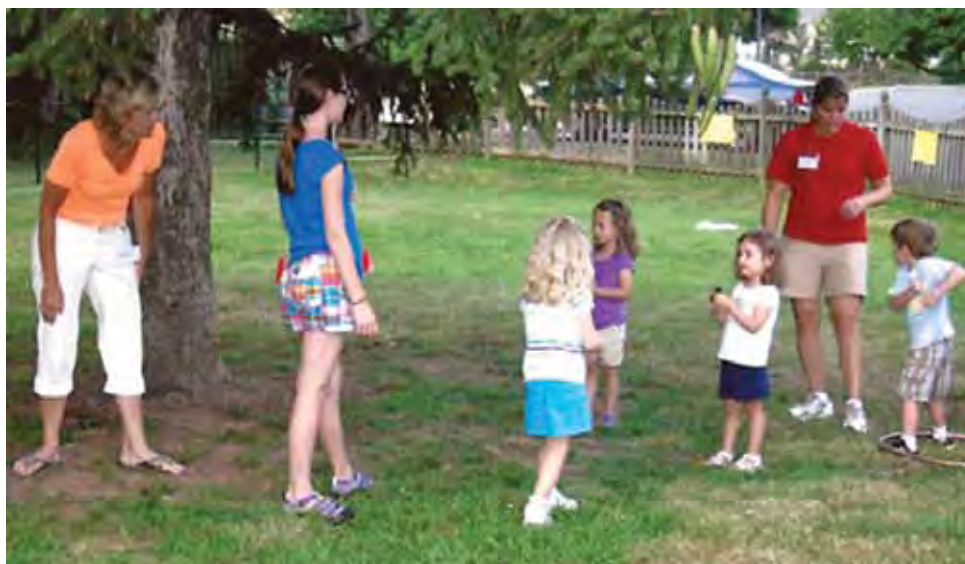
A break in the heat brought the Memorial United Methodist Church VBS kids outside for fun.