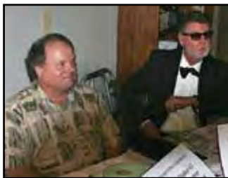
The Poolesville Copacabana Club was the place to be, if you could get past the owner and his bouncer. More pictures are in the Family Album on page 2.