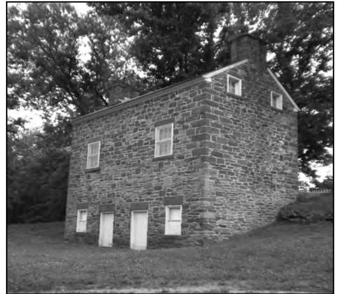
The lock house at Riley's Lock.