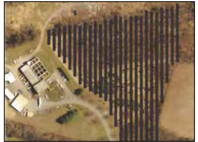
The proposed solar farm on ten acres adjacent to the Poolesville Water and Wastewater Treatment Plant.

with ongoing negotiations and enter into a Power Purchase Agreement with one solar array firm will be announced at the August 6 town meeting.