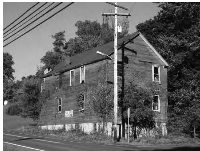
The Warfel Store