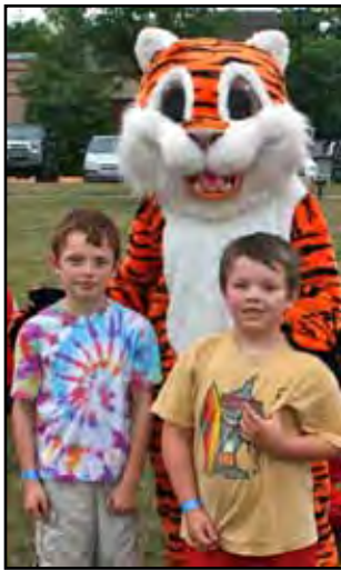
Everybody who was anybody was at the Poolesville Elementary School Carnival. See our special photo section on page 11 for more.