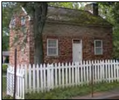
Do you recognize this house? The answer is on page 5.