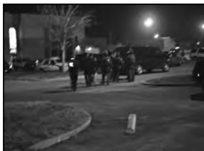
The police resolved a barricade concern peacefully.

ished as to the danger and asked what she would do if the ladder tipped, even at ninety-three, she had a simple answer: “Why, I would just jump clear.” A child of the Depression, she became the ultimate recycler.