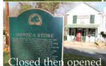
Closed then opened