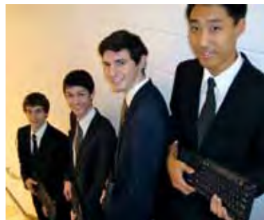
New rock band? Hardly. See School News on page 8.