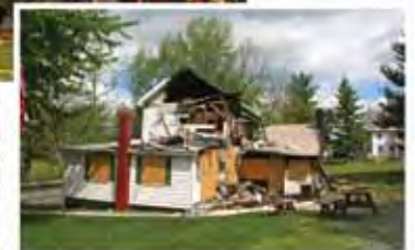
Earthquake (Fortunately, no pictures)