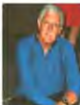
Mayor Pete Menke