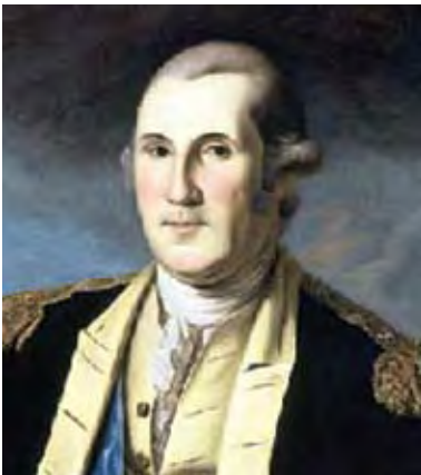
A young man, with questionable prospects for future success, at the core of the Daytripper on page 6.