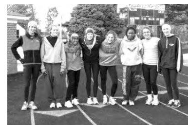
Some of the ladies on the 2011 PHS Indoor Track Team.