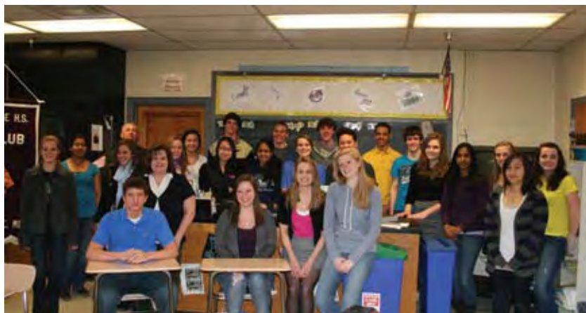
The PHS Leo Club is a community youth service group sponsored by the Monocacy Lions Club.