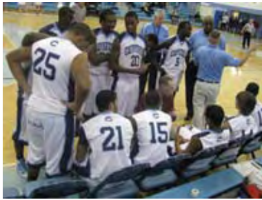
It's basketball season, and you can read about the Clarksburg Coyotes on Page 9, and the Poolesville Falcons on Page 12.