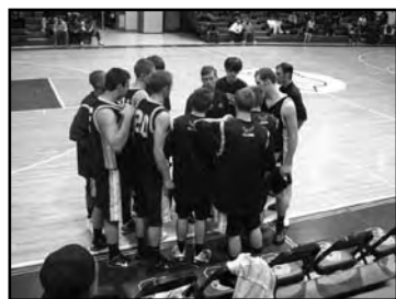
The Poolesville Falcons huddle up.