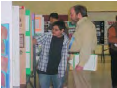
There was plenty of action at the John Poole Middle School Science Fair. Read about it on Page xx, and see the pictures in the Family Album on Page 10.