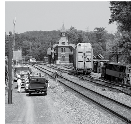
Fire crews were on the scene minutes after the derailment of the CSX train at Point of Rocks.

between fallen trees. On June 10th another storm affected the area from Dickerson to Brunswick causing more trees to fall on the railroad tracks and power failures affected CSX signals.