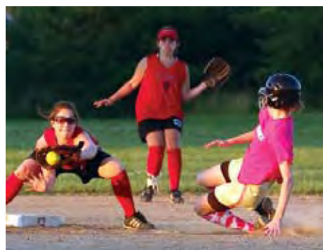
The Red Raiders play for keeps. Read about them in Youth Sports on Page 10.