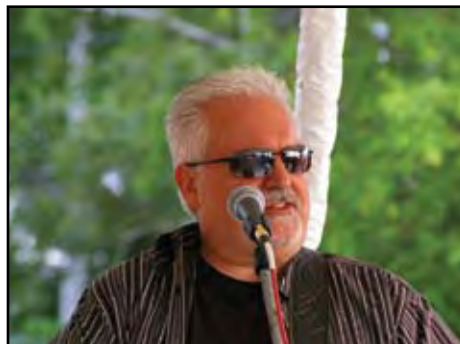
You may recognize this face from the radio. See Family Album for more.