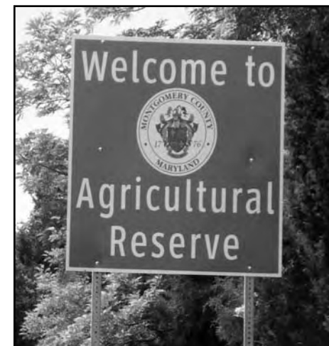
A friendly sign for one and all.

come, and remember that it isn't there by accident.