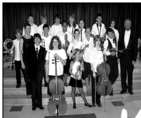
The Poolesville Youth Symphony Orchestra.