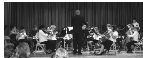
The Poolesville Youth Symphony Orchestra in Concert