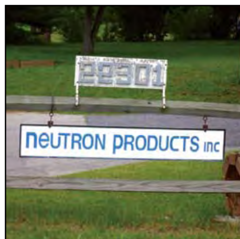
Neutron Products in Dickerson

A Montgomery County Circuit Court judge ruled in 2005 that Neutron was in contempt for its failure to make regular shipments of radioactive waste from the plant where the company once used cobalt 60 in commercial sterilization and the production of medical supplies. Neutron appealed the decision. The Maryland Court of Special Appeals filed an unreported opinion in the matter