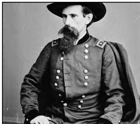
The man who wrote Ben Hur also helped save our Nation's Capital during the Civil War. Read more about Lew Wallace in Daytripper on Page 9.