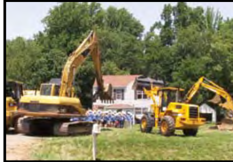
The crew and the demolition team surrounded the house just prior to starting the job.