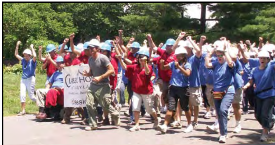
Ty Pennington, host of Extreme Makeover: Home Edition leads the workers in their march to the work site. Many more will work and volunteer throughout the week on the program.