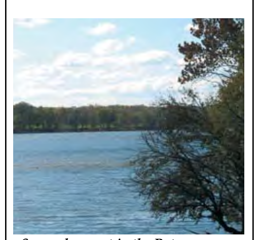
Somewhere out in the Potomac was Walnut Island. Local History may help you find it, on page 10.