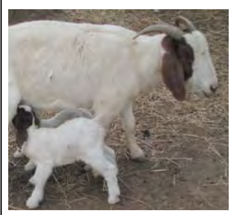
When all is said and done, it really is all about the kids. See Ag News on page 3.